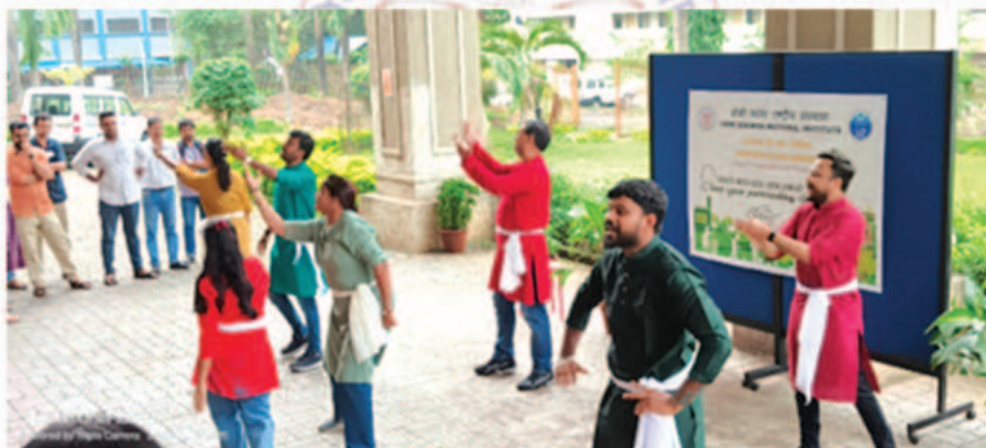
Street play titled “Itne Se Kya Hoga” being performed at HBNI on September 27, 2023