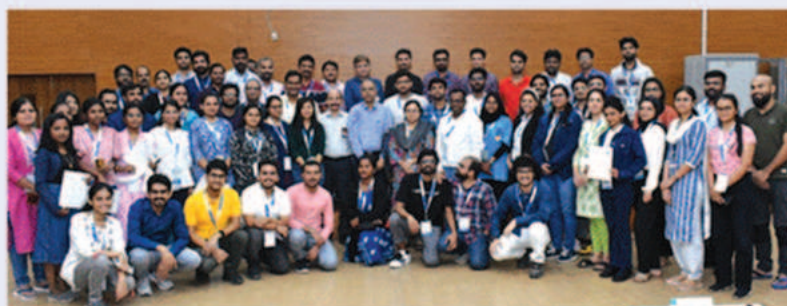
Participants of the National Workshop on AMMM-2023 organized at BARC Mumbai