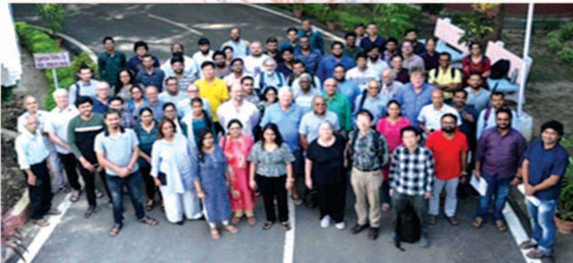
Participants of International conference on Representation Theory and Harmonic Analysis

The international conference on “Representation Theory and Harmonic Analysis” was organized at HRI from October 9, 2023 to October 14, 2023. Several eminent Mathematicians (national and international) attended the conference. This was an excellent exposure to the Indian mathematicians. Covered topics included Representation theory of Real Lie groups, Harmonic analysis, Automorphic forms, Langlands correspondence etc. There were around 100 participants including 4 Indian speakers and 17 international speakers.