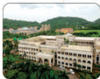
HBNI Central Office