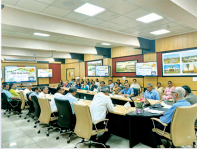
परिषद कक्ष में हिंदी दिवस समारोह में भाग लेते एचबीएनआई के पदाधिकारी एवं कर्मचारी