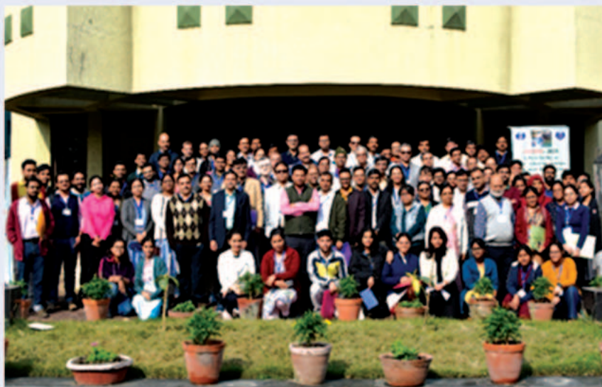
Participants of the theme meeting SUCCESS-2023

A special session was also organised for PhD students, postdoctoral fellows, and young faculty members (age below 35 years) to present new and innovative experimental proposals using SCC beam. Out of the seven proposals presented, three best proposals received from Visva Bharati, BARC and ISM Dhanbad were selected and awarded by a bench of experts.