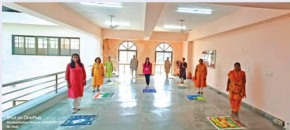
Participants of Rangoli competition with their rangolis