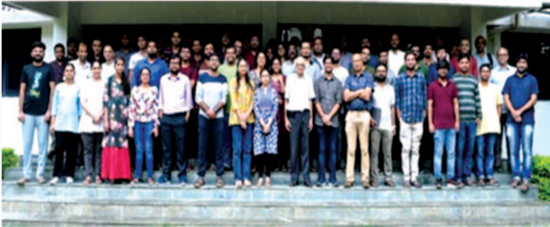
Participants of workshop on “Representation Theory of Real Lie Groups and Automorphic Forms”