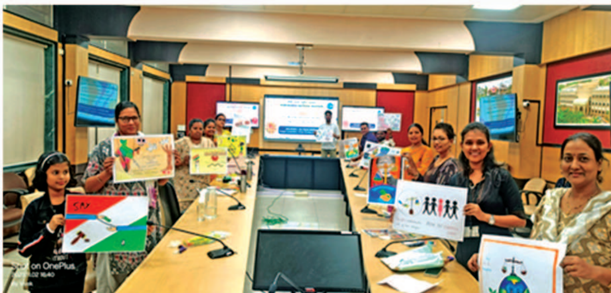
Participants of poster competition displaying their posters