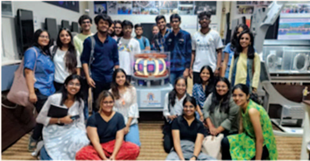
Students of Ahmedabad University, Ahmedabad during their visit to IPR, October 25, 2023