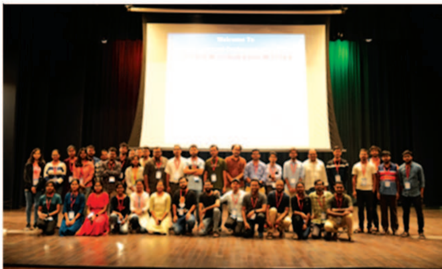
Participants of Annual Conference on Quantum Condensed Matter