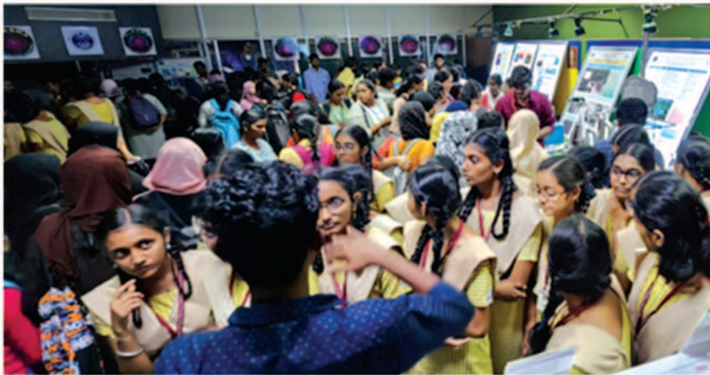
Plasma exhibition at Periyar Science & Technology Centre, Chennai, during July 3-7, 2023