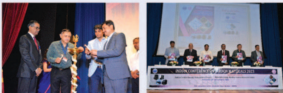
Dignitaries lighting the lamp during the inaugural session of the conference (left) and releasing the conference proceedings (right)