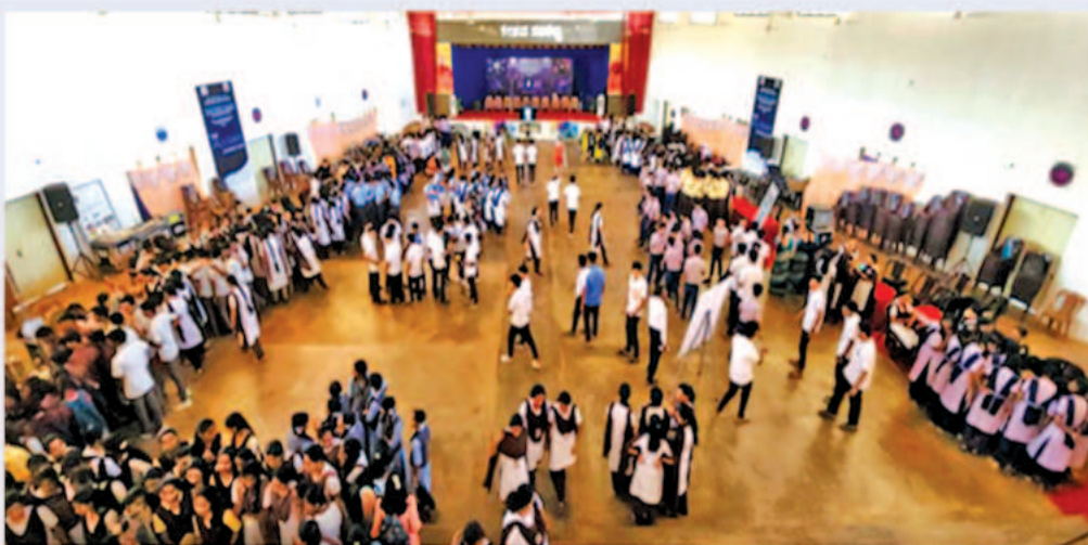
Plasma exhibition at Vivekananda College of Arts, Science and Commerce, Puttur, Karnataka during August 30-September 1, 2023