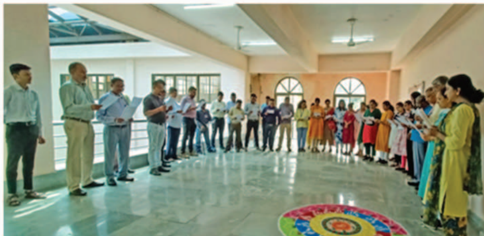
HBNI officials and staff undertaking Integrity pledge on October 30, 2023