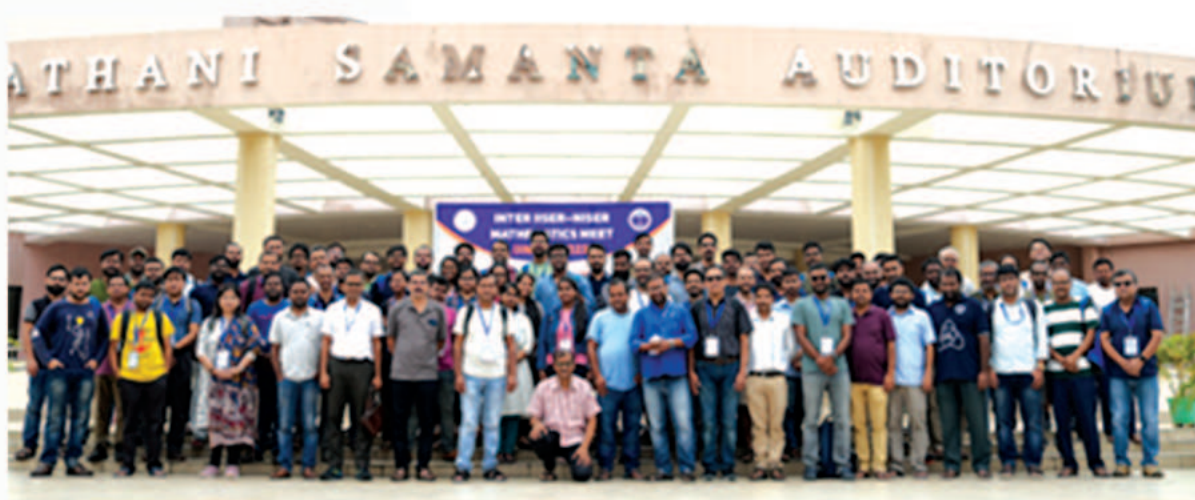
Participants of Inter IISER-NISER Math Meet

The Inter IISER-NISER Mathematics Meet (IINMM) is a joint initiative of all the IISERs and NISER. The meet was organized at NISER during September 29-October 1, 2023 with an aim to bring together researchers from the IISERs and NISER on a common platform to exchange ideas and promote collaborative research in all areas of Mathematics. It also gave an opportunity to the PhD students and PDFs of these institutes to showcase their research works, interact with other researchers in related fields and explore the possibility of collaborative research.